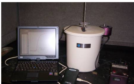
St. Norbert College received a HP Higher Education Technology for Teaching Grant to better integrate the lab and lecture experiences in Chemistry.

Grant projects advance institutional goals by enhancing College revenue and bringing outside recognition of accomplishments and innovations.