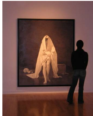
"Two Cultures, One Spirit" featured artwork from visiting Japanese artists and their Wisconsin hosts. This exhibition was funded in part by a grant from NewArts, the Northeastern Wisconsin Arts Council.