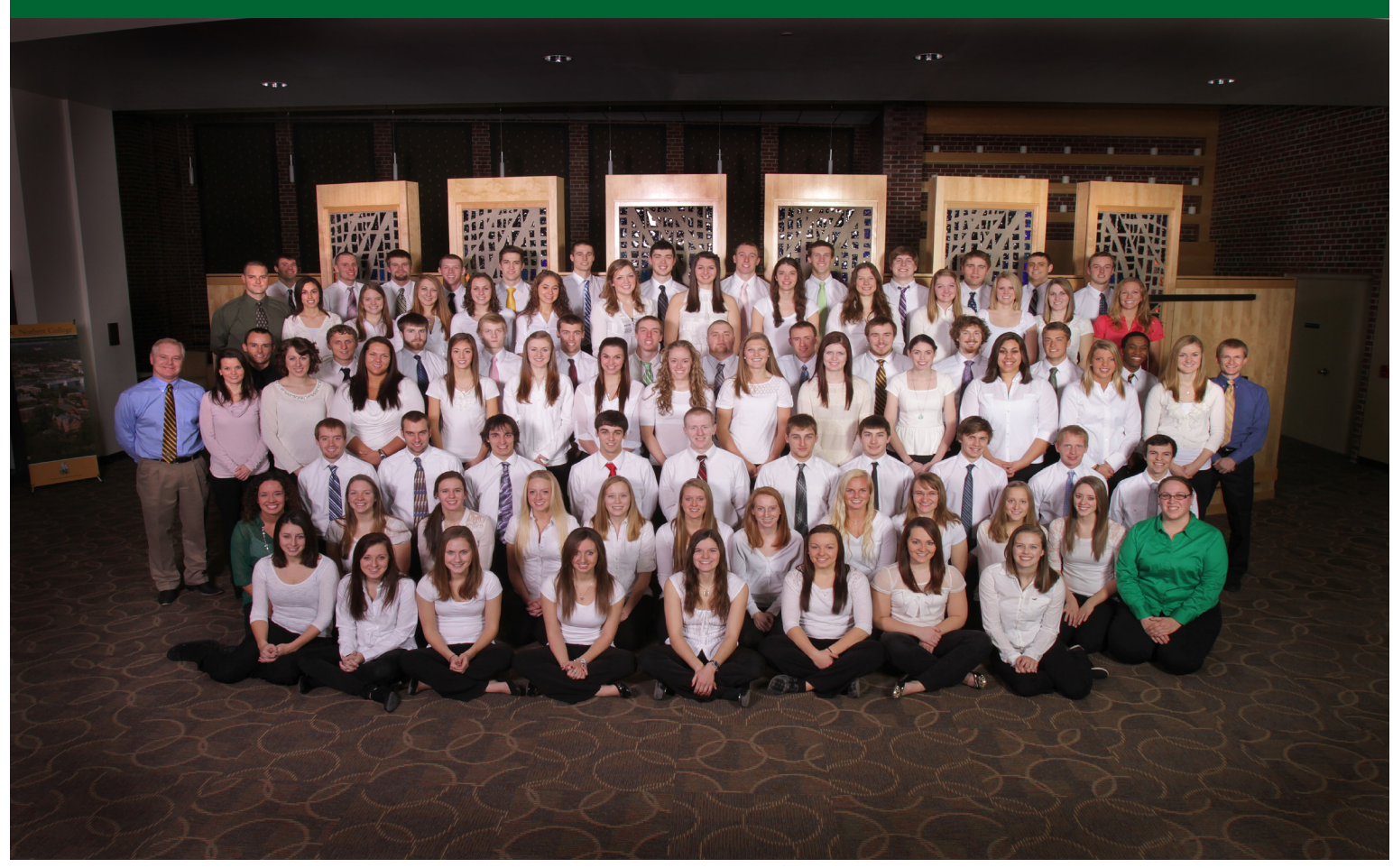
The 2014 Track & Field Season is underway with the teams sights set on the first ever men's MWC title and the first for the women since the 1991 season!