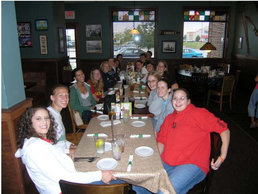
Alive Team member enjoy dinner together during fall training.