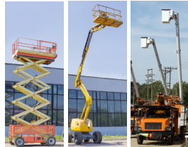
A scissor lift (left), a cherry picker (middle), and a bucket truck (right).

An aerial lift can prevent falls and reduce the risks for back, neck and shoulder injuries caused by working at or above shoulder level by positioning you where you need to work.