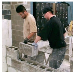
Workers use the two-mason lift technique to reduce stress of lifting and twisting.

2 Change your work routine Re-position your body so that you are not contorted or repeating a motion. Raise your work to waist level. Have materials delivered near your work. Take rest breaks. When you are tired, you can get injured more easily.