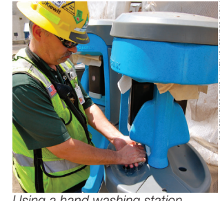
Using a hand washing station