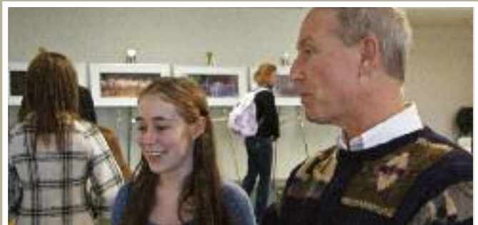
March 2009 ▶ Faculty, staff and students celebrate their collaborative research projects.