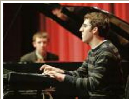
◀ April 2009 "Fresh Ink" presents a concert of original compositions written by music students.