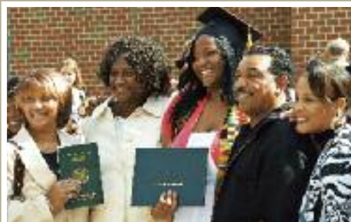
May 2009 ▶ Commencement dawn bright for the graduation of the class of 2009.