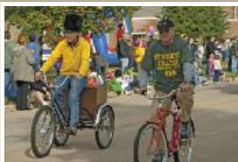
October 2008 ▶ Homecoming. The Green Knights beat Carroll University 20-17.