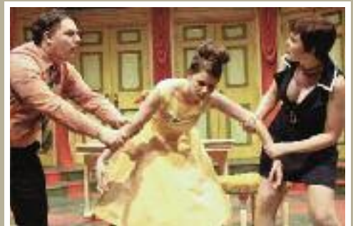
April 2009 ▶ St. Norbert Theatre Studies presents "Tartuffe" as its spring production.