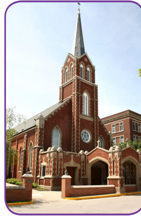
St. Norbert College Parish

Established 50 years ago, St. Norbert College Parish was the first college parish in the United States. For many, St. Norbert College Parish is a haven as they begin their college experience. It is a place they can turn to when searching for the comfort they left at home. For many more, St. Norbert College Parish continues to be a faith home as they grow and mature. Our inviting and lively parish environment also draws many who have no previous connection to the college. It is this unique blend of people who comprise the parish and make it truly one of a kind.