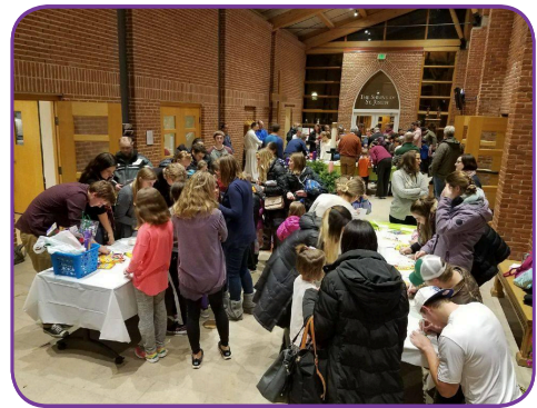
Building relationships through Generations of Faith.

We understand that not everyone can make the same gift. However, we encourage all those who make St. Norbert College Parish their spiritual home to make a sacrificial pledge, payable up to a three-year period to help us build the Kingdom of God, one by One .